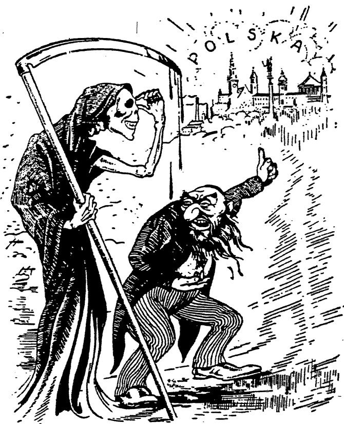
Wzór okładki do broszury „W szponach komunizmu”.

Po Rosji i Hiszpanji — kolej na Polskę! Trzeba ją skapać we krwi! Zostawić po niej ruiny i zgłiszczal! Żyd już wiedzie kostuchę na żniwo do Polski! Baczmy na ten pochód i czuwajmy, bo gorze nam! Gerze!!!