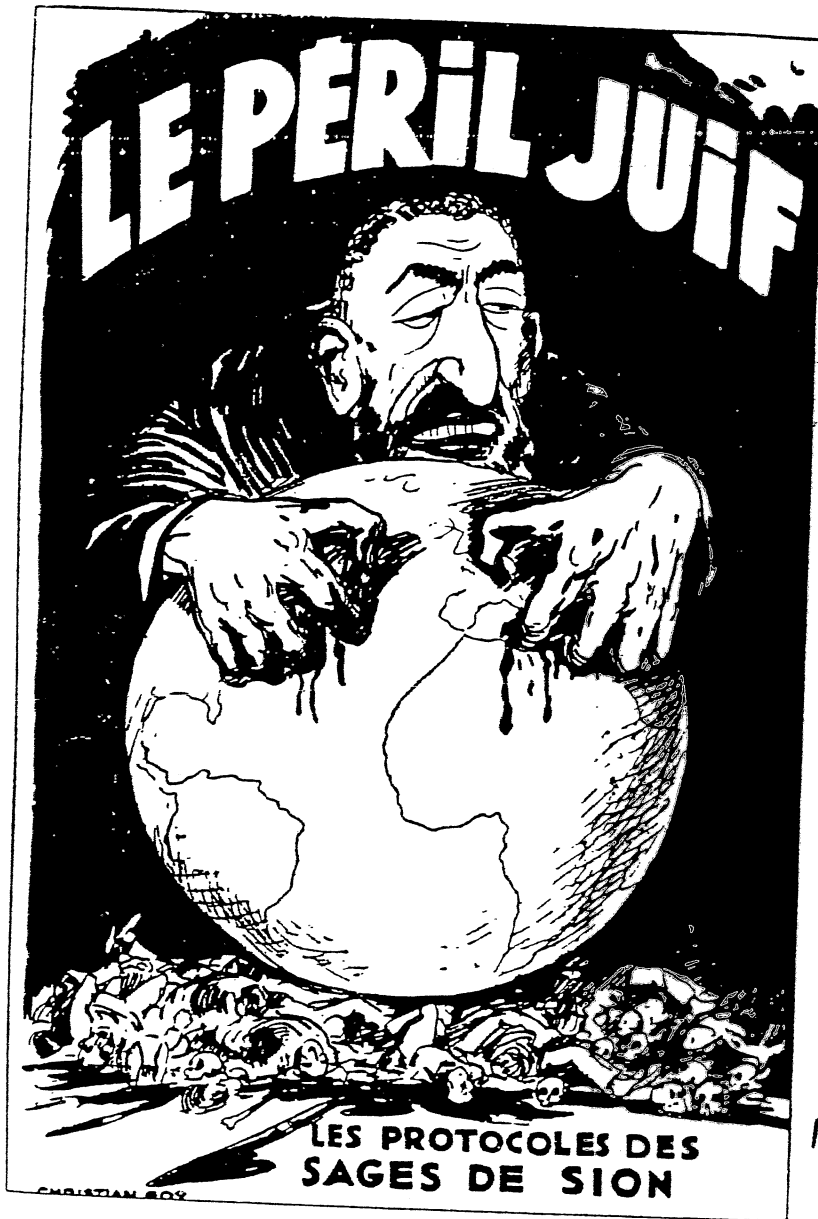
Figure 4. Cover of a popular French edition of the Protocols, c. 1934.

In 1921 and it was to be each version to be trans- lated as the work of Roger Drumont heading the political front of the old-style royalists and the Action Française. Successful – it ran to sixteen editions and had risen to twenty- four by the time of the Second World War. The introduction that claims to be alongside the lucubra-