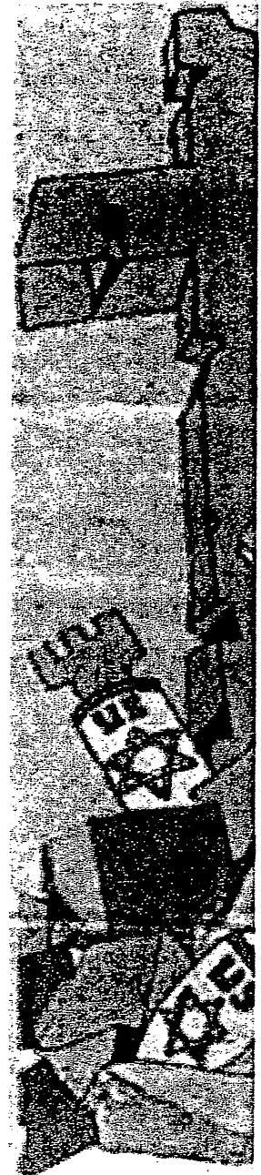
Jews/Israelis/Americans crucifying Palestine