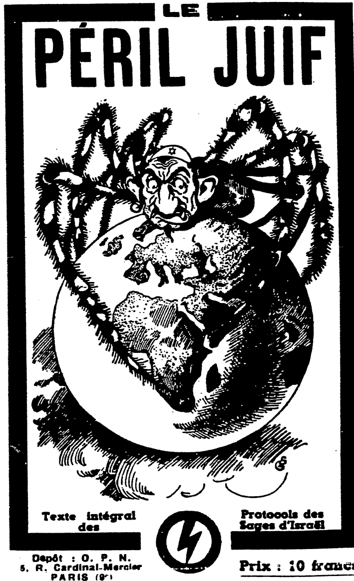
Figure 5. Cover of a popular French edition of the Protocols, c. 1934.

1 to his translation of the Protocols , pp. vi,