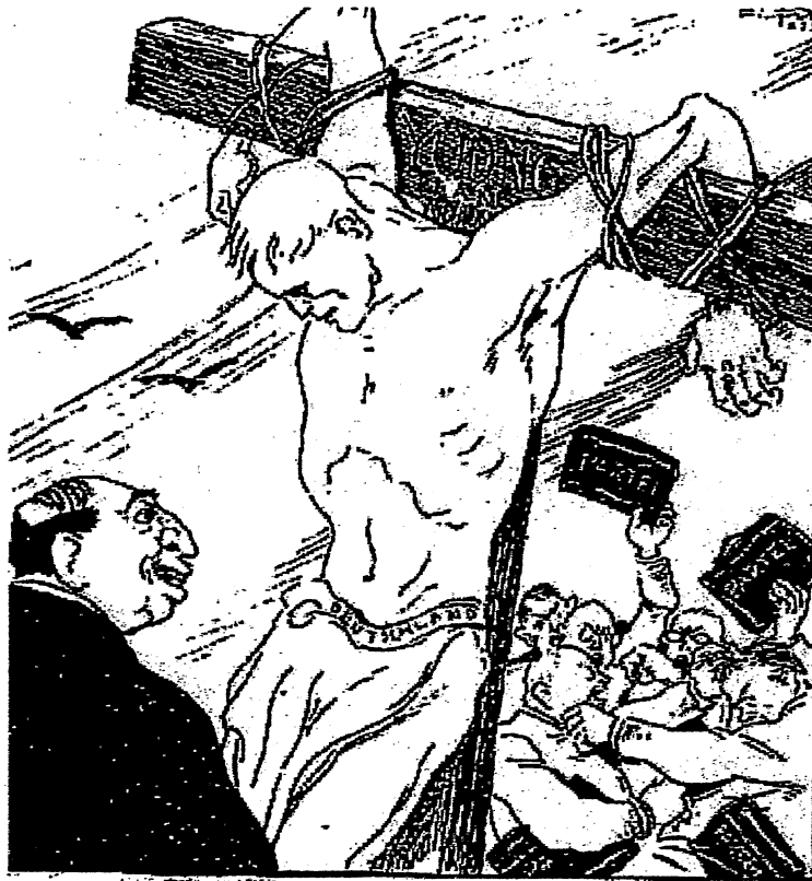
Sie t ufen ihn und der Jude grinst